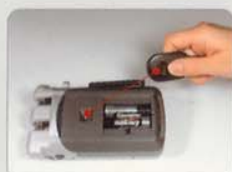
Register remote control